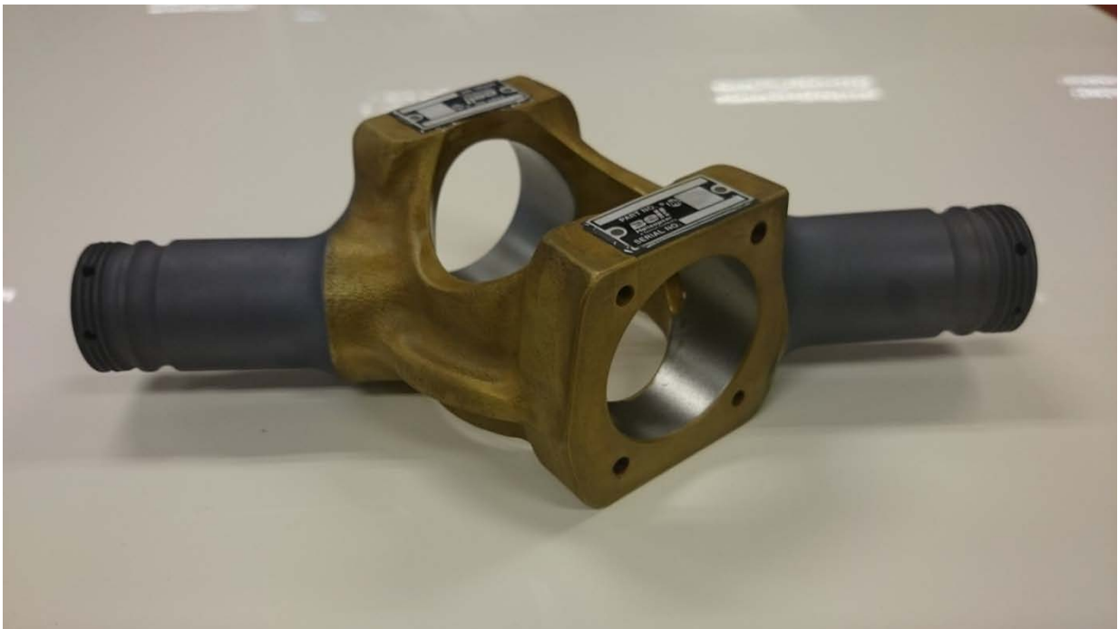
Figure 2. Conversion Coating Application Areas