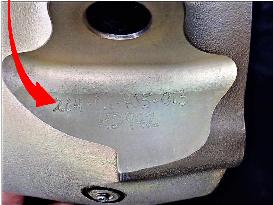
Figure 2 – Vibro-Etched Part Number and Serial Number Location