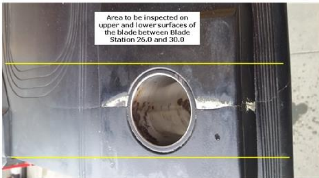
Figure 4 - Area to be Inspected with a 10X Power Magnifying Glass (Upper and Lower Surfaces)

Note: It is not required to remove the blade for inspection. The areas under the grip tangs will not be visible.