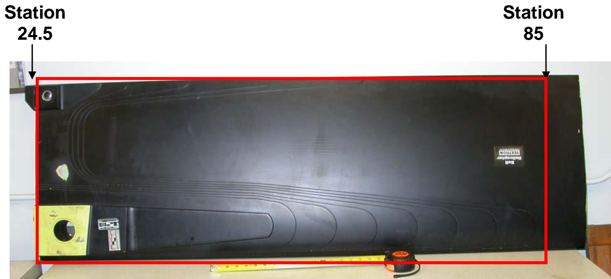
Figure 1. Area to be inspected with 3X-power magnifying glass (upper and lower surfaces)