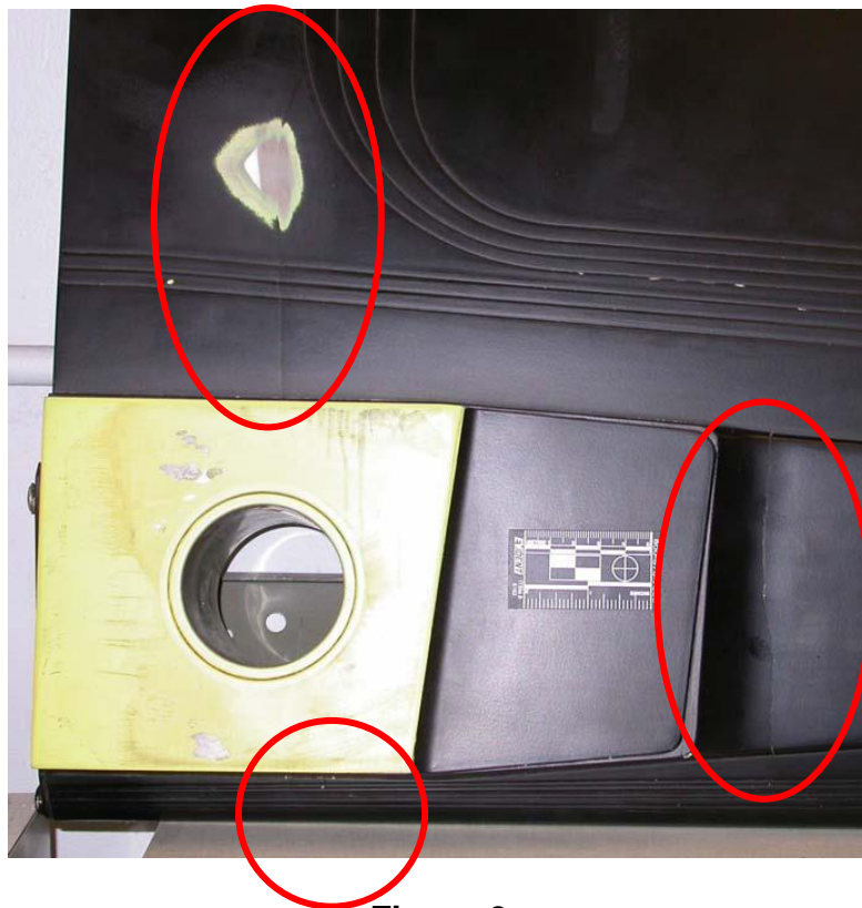
Figure 2 Crack Indications