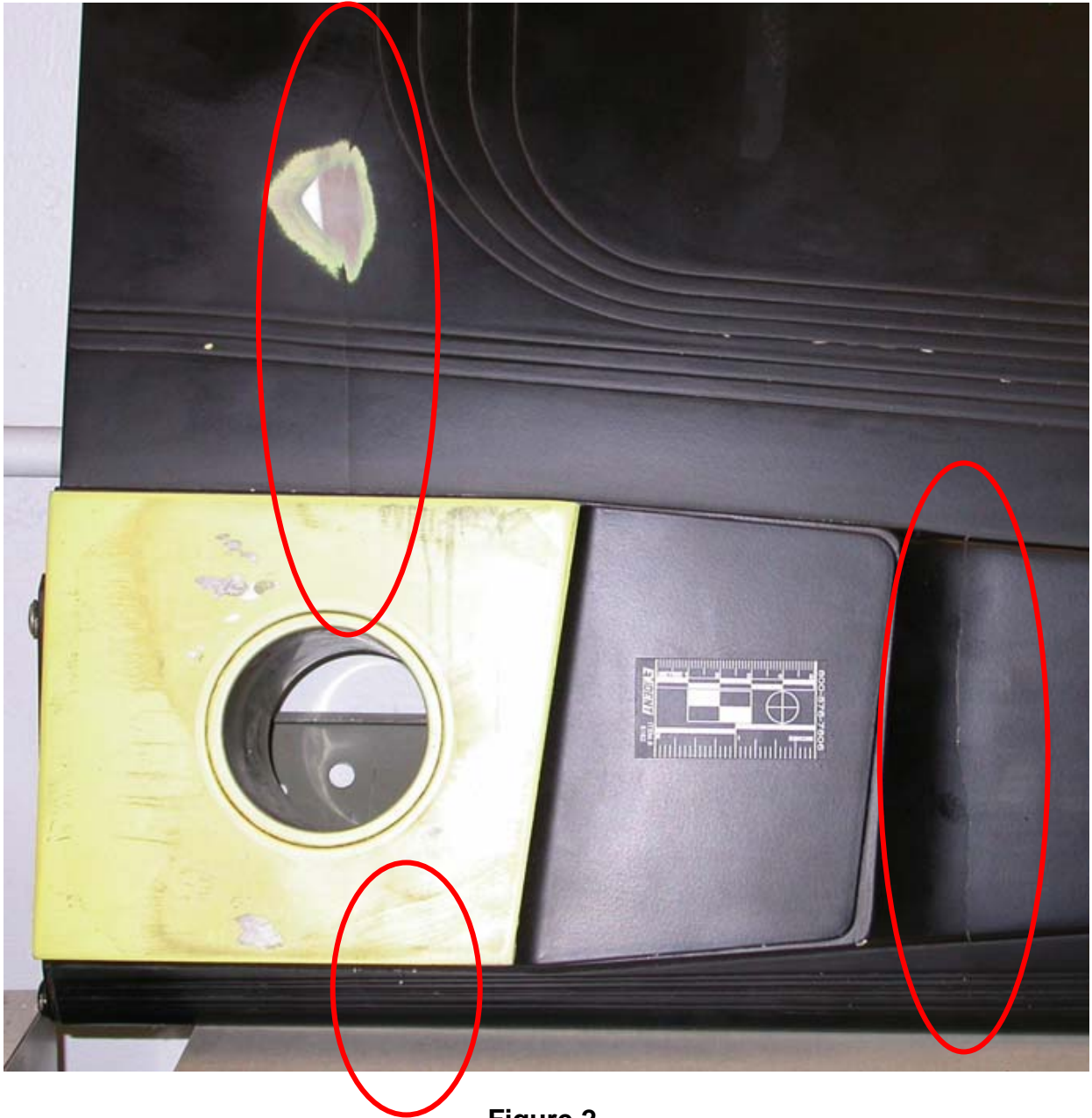
Figure 2 Crack Indications