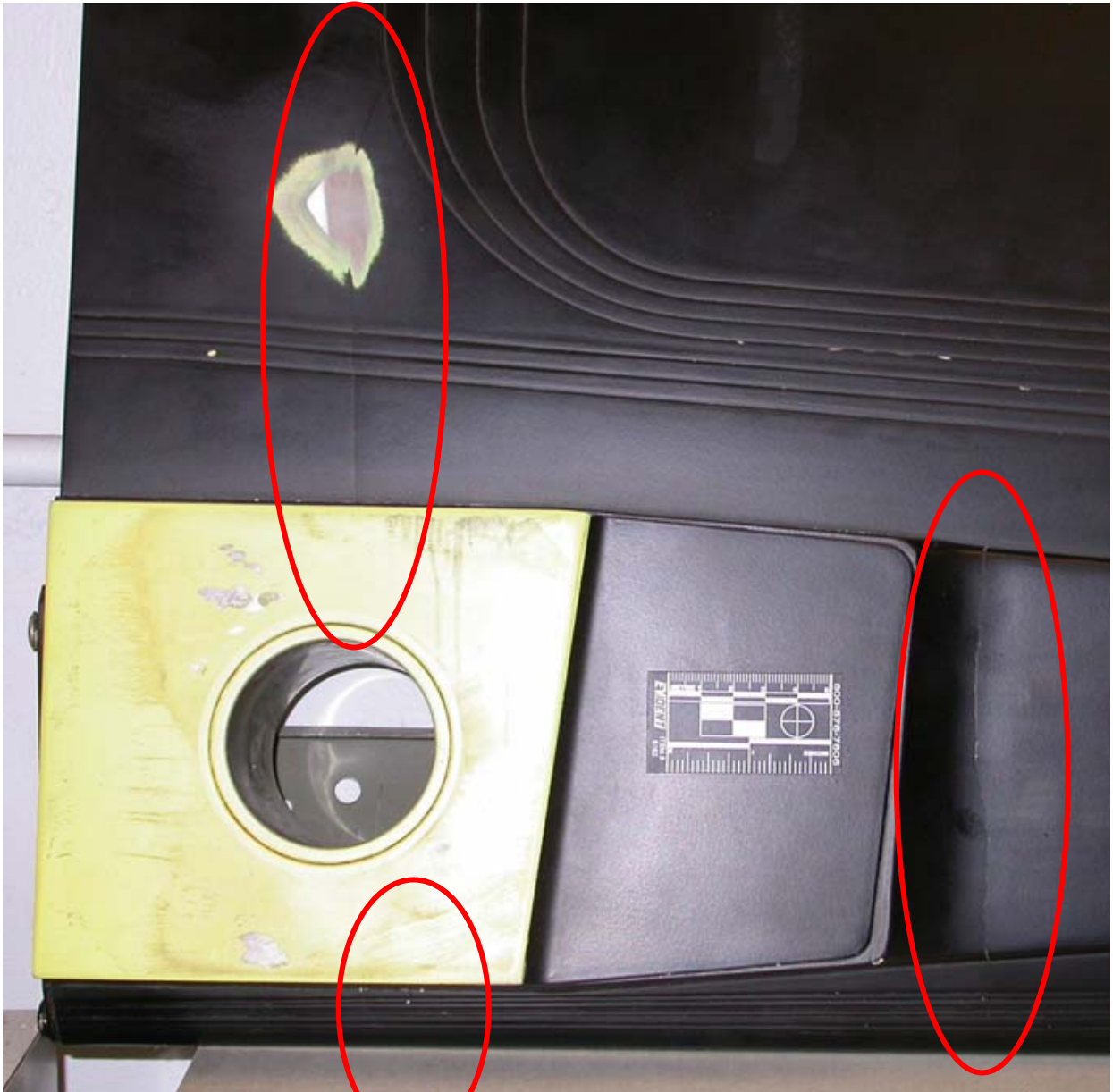
Figure 2 Crack Indications