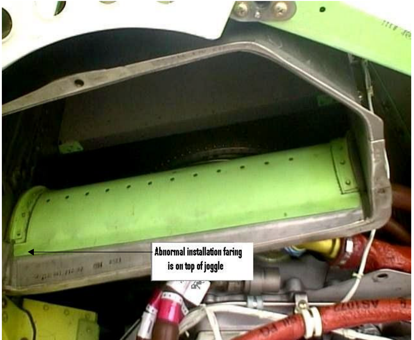
Abnormal installation fairing on top of joggle