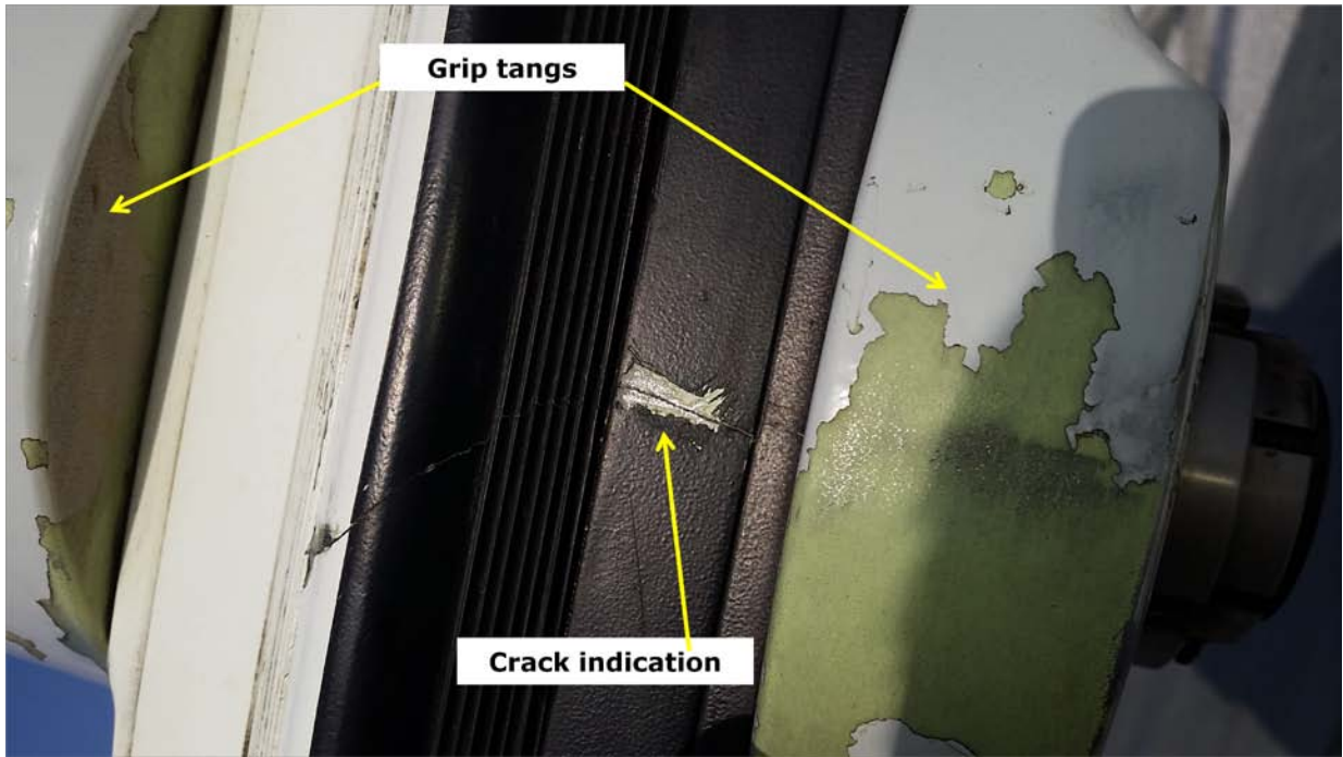
Figure 3 - Crack indication