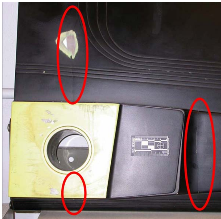
Figure 2 - Crack indications