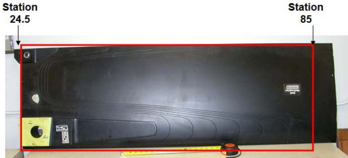
Figure 1 - Area to be inspected with 3X Power Magnifying Glass (Upper and Lower Surfaces)