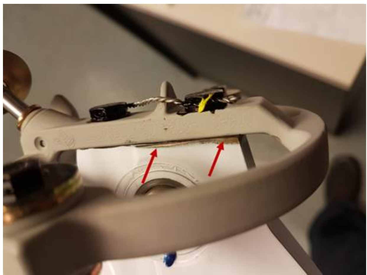
FIGURE 1 - Tail Rotor Blade Root End without Sealant