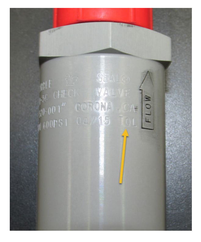
Detail A. Circor Aerospace Engine Oil Check Valve Marked "TQL"