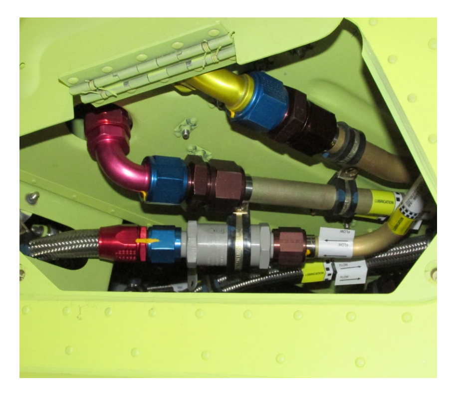
Detail A. Engine Number 2 (Right Side)