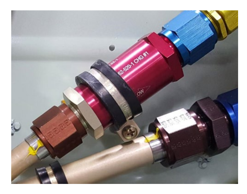
Detail B. Engine Oil Check valve not Manufactured by Circor Aerospace

Figure 2. Engine Oil Check Valves not Affected