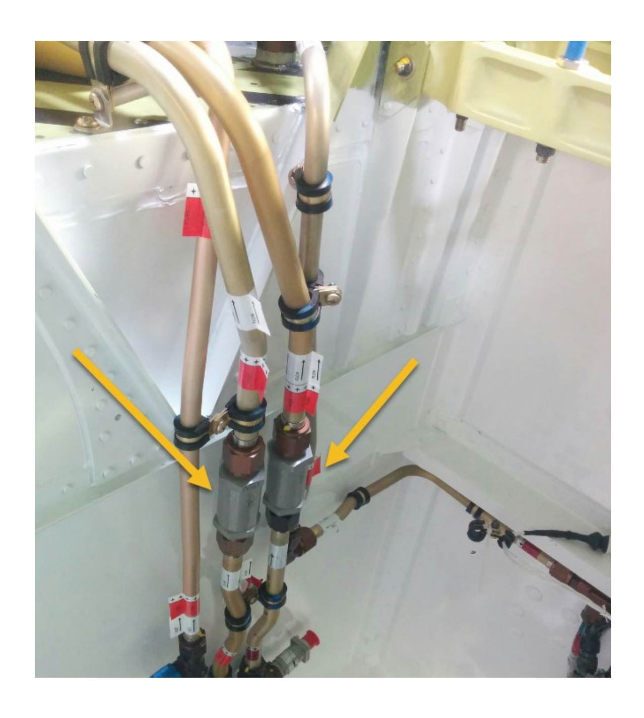
Figure 1. Fuel Check Valves Location

ASB 412CF-20-70-RB Page 7 of 9 Approved for public release.