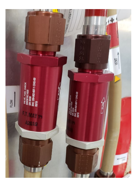
Detail B. Fuel Check Valves not Manufactured by Circor Aerospace