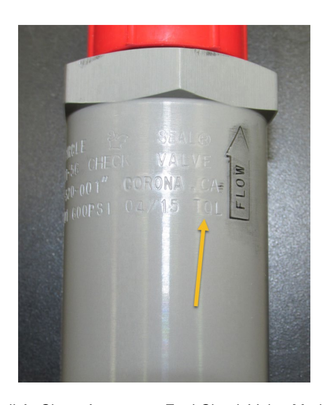
Detail A. Circor Aerospace Fuel Check Valve Marked "TQL"