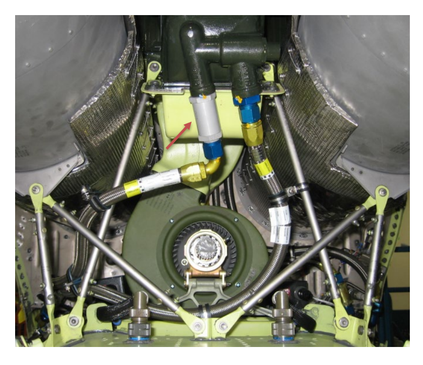
Transmission oil check valve and location Detail A