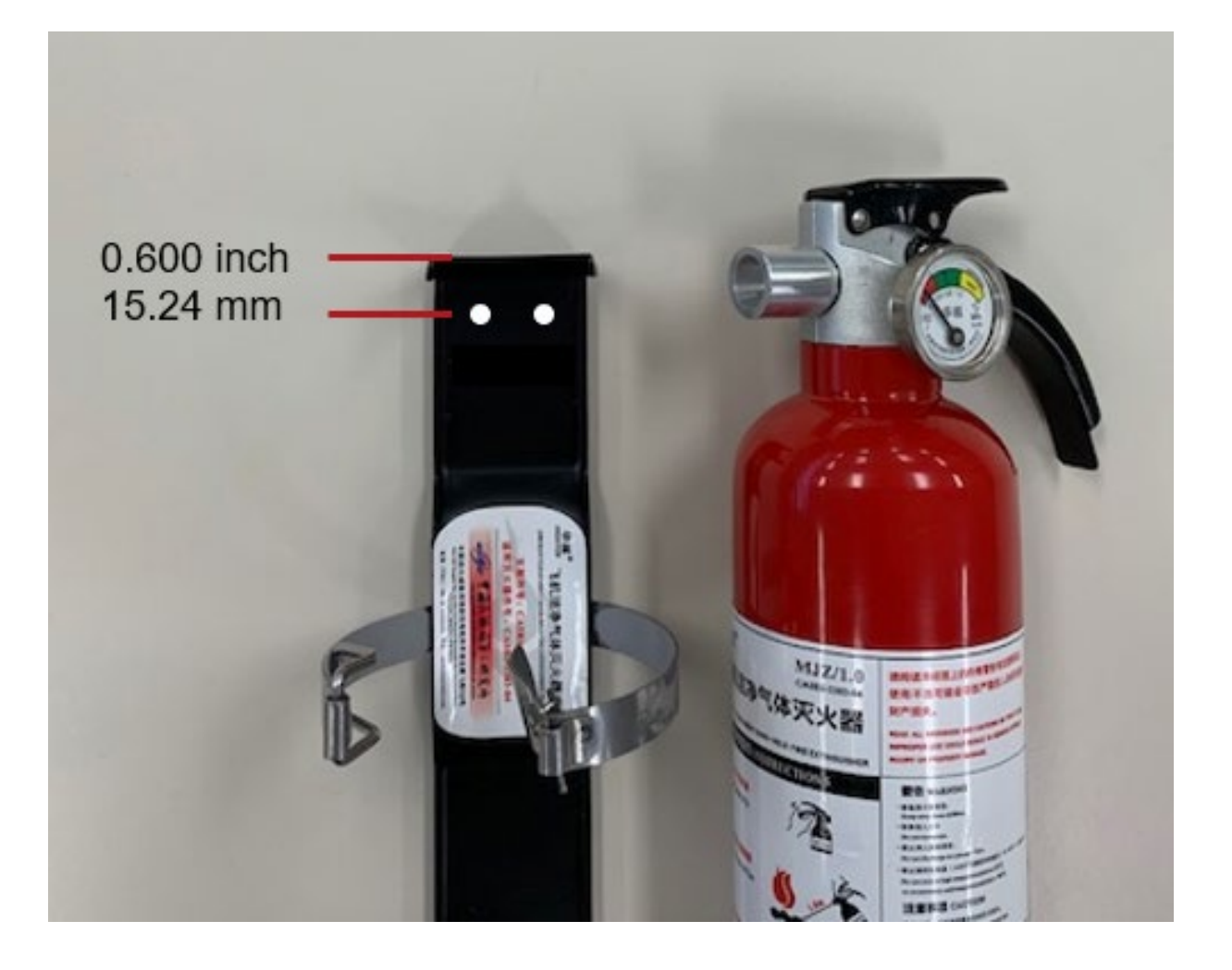
Figure 1. Floor and door post mounted bracket attaching screw hole location.

TB 412-22-248 Page 5 of 6 Approved for public release.